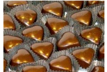
Double Dark Hearts