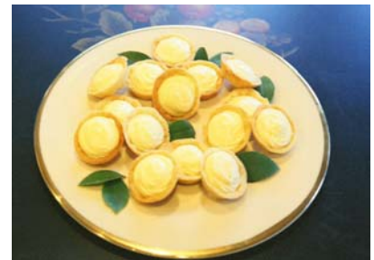
Lemon Cream Tartlets