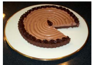
Double Dark Chocolate Tart