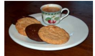
Peanut Butter & Chocolate Chocolate Cookies