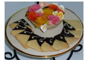
Chocolate Dipped Cardamom Orange Shortbread