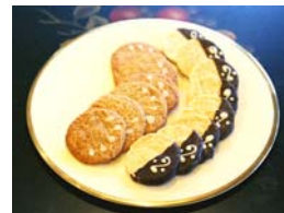
Chocolate Dipped Almond Shortbread & Oatmeal Butter Cookies (Oatmeal Butter not available)