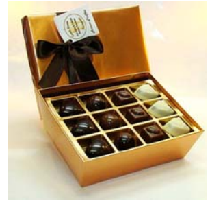
24 Piece Classic Collection**