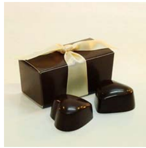
2 Piece Favor Box Double Dark Hearts