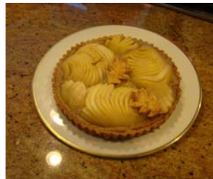
Apple Walnut Tart