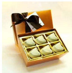
12 or 24 Piece Classic Swans