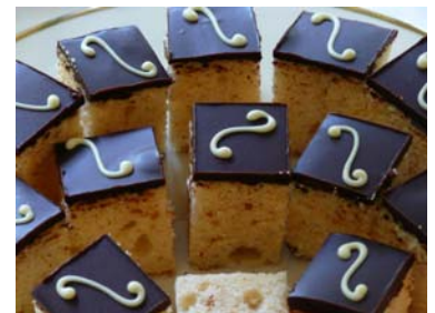
Chocolate Almond Cake Bits