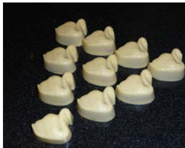
Classic White Chocolate Swans