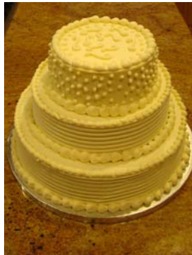
White Chocolate Cheesecake