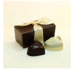
2 Piece Favor Box Heart and Swan