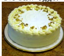
Fresh Carrot Cake