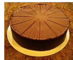
Chocolate Mousse Cake