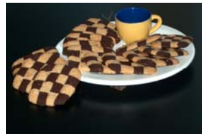
Cocoa Almond Checkerboards

Chocolate Dipped Vanilla Shortbread Cookies $13.00 dz Our wonderful shortbread with organic vanilla, dipped in premium chocolate. App: 2 3/4" square. 3 dz min