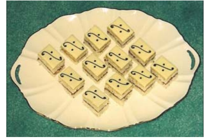
Hazelnut Raspberry Pieces

Petit Fours Cupcakes $ 8.00 Beautiful bite-sized cupcakes (no paper liner) topped with a swirl of frosting. per dz Carrot Cake w/cream cheese frosting 3 dz Chocolate w/chocolate butter cream min. of Chocolate w/vanilla butter cream one Vanilla w/chocolate butter cream flavor Vanilla w/coconut butter cream Lemon with lemon butter cream