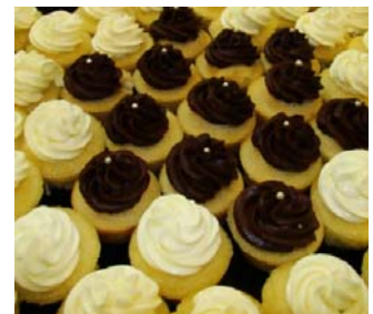
Petit Four Cupcakes