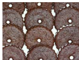
Chocolate Coconut Cream Cookies

Coconut Shortbread Cookies $13.00 dz A tropical twist to our shortbread! App: 2 3/4" square. 3 dz min