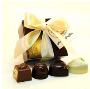
4 Piece Box**