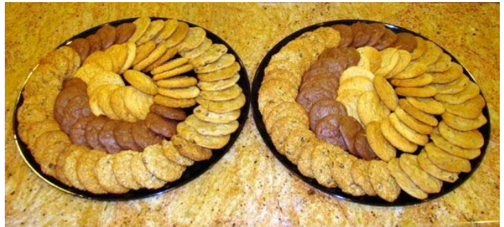
Large Party Cookie Platters