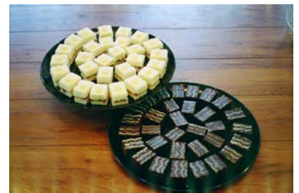
Indulgent Brownies & Cake Bits