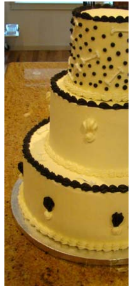
Lemon Poppy Seed Cake

Ribbon around bottom of tiers Handmade White Chocolate Roses, Colored or Off-White Handmade Calle Lilies