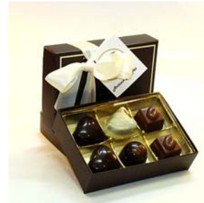
6 Piece Box**