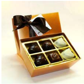
12 Piece Classic Collection