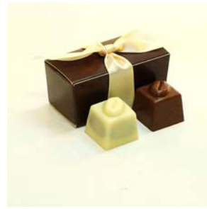
2 Piece Favor Box Milk and White Espresso