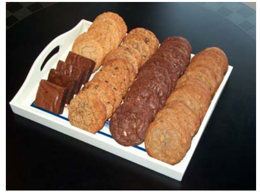
Brownies, Peanut Butter Cookies, Oatmeal Raisin Cookie, Choc. Choc. Cookies, & Choc. Chip Cookies

Petit Fours Party Platter $77.00 Make an impression with this 2 platter collection of bite-sized desserts! 89 pieces on 2, 16" platters. 20 Hazelnut Marion Berry Pieces (app. 1" x 2"), 25 Indulgent Triple Chocolate Brownies (app. 1.5" x 1.5"), 12 Petit Fours sized Carrot Cake Cupcakes, 16 Lemon Cream Tartlets, and 16 Chocolate Dipped Orange Cardamom Shortbreads. For a group of 25-35.