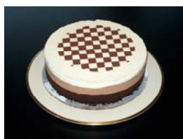
Triple Chocolate Mousse Cake