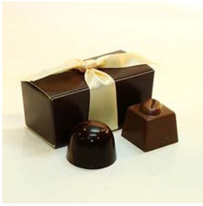
2 Piece Favor Box Chocolate Pecan & Milk Chocolate Espresso