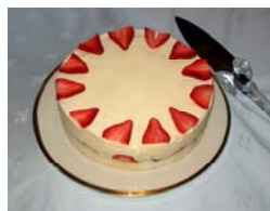
Strawberry Bavarian Cake