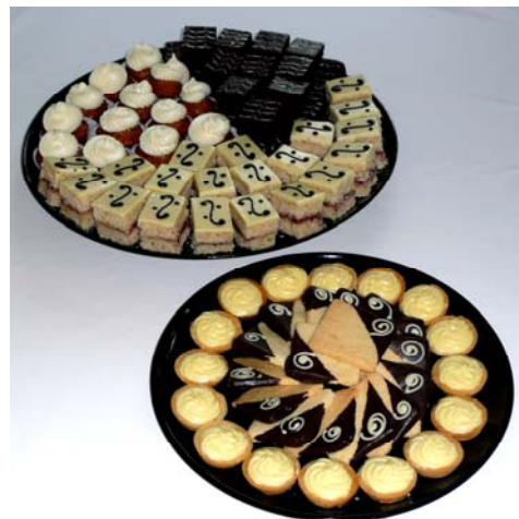
Petit Four Party Platter