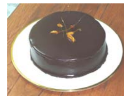
Luscious Chocolate Almond Torte